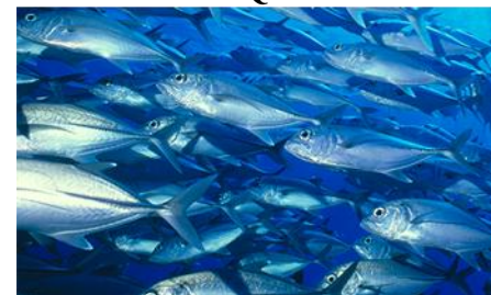
Schooling fish action.